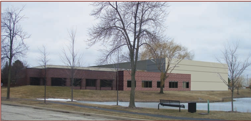
Artist rendering of the Waukegan facility expansion.